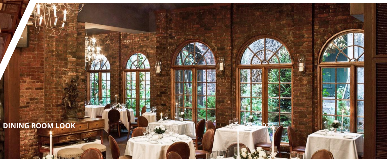
DINING ROOM LOOK